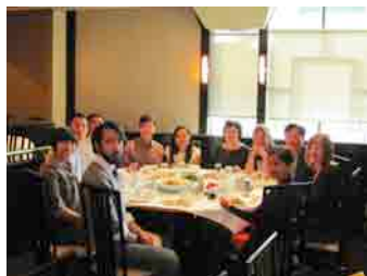
Dinner in Ottawa with filmmakers.