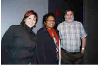
Representatives from Winnipeg Film Group and Manitoba Asian Heritage Month.

Sook-Yin Lee's Year of the Carnivore : WIN SNEAK PREVIEW PASSES - June 17